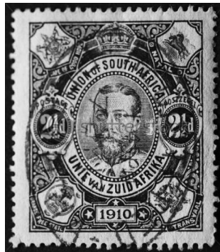
Image 2: A Postage stamp of the Union of South Africa with the head of British King George, ca 1910