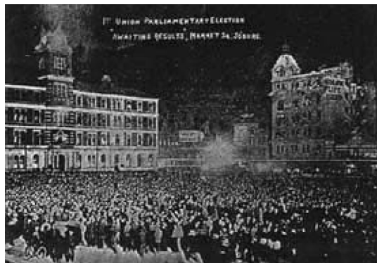
Image 1: The Market Square in Johannesburg were crowds await the result of the first Parliamentary election of the Union of South Africa held on 15 September 1910. The Government Party won even though Louis Botha lost his Pretoria East seat.